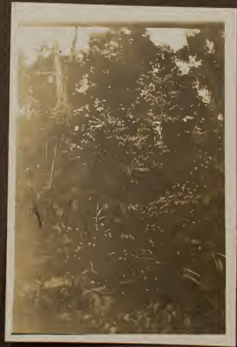
Tambora River Forest or Scrub